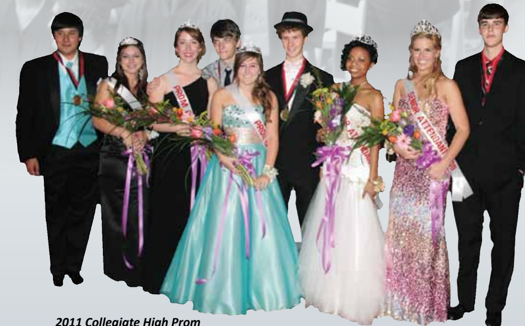
2011 Collegiate High Prom